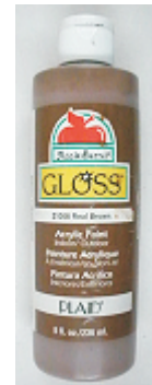
Acrylic Craft Paint from Michael's Arts & Crafts™ (Apple Barrel "Burnt Umber" #20745)