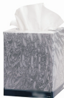
Cube tissue box fits inside

The finished outer dimensions of the sample Twiggy Tissue Box Cover are about: 6" W x 6" D x 6" T