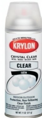
Krylon Clear Gloss and Flat Acrylic from WalMart™