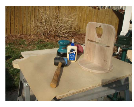
Glue the base to the center piece. A rubber mallet might be needed to push the center piece into the base piece.