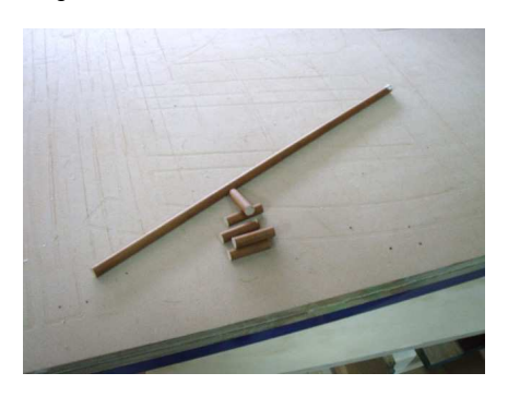
The project calls for 14 dowels cut down to 2" long. Cherry is used for this project to accent the red oak for the main wood.