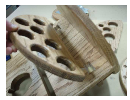
Insert glue into the pockets. Push the shelf into these pockets and allow to dry.