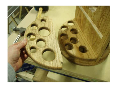
Note the size of the holes. The bottom shelf has smaller holes to help keep utensils standing straight up and down. However, make sure the upper shelves holes line up with the holes of the bottom shelf.