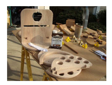
At this point stain all of the pieces to the desired color. Also apply polyurethane to the project after the stain has had time to setup and dry.