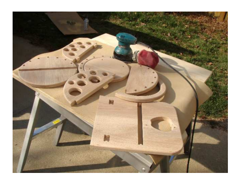
Sand all the parts evenly at this step. It is much easier to get to all of the parts at this state then before it is glued up. Putting a 1/4" roundover on all of the edges adds eye appeal to the project.