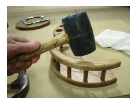
Complete the dowel installation process before installing into the shelves.