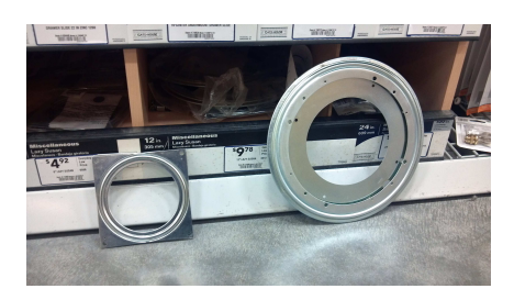
Different size lazy susan fixtures can be found at the local hardware store, Lowes, Home Depot or even ordered online.