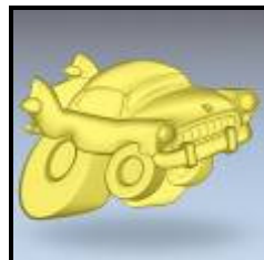
18 Hot Rod