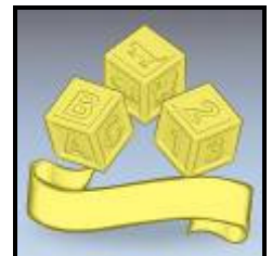
16 Toy Blocks 1