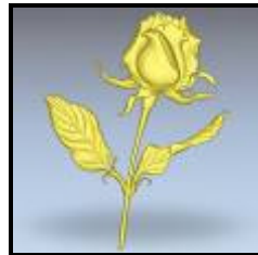
6 Stem Rose