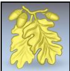
13 Oak Leaves and Acorns