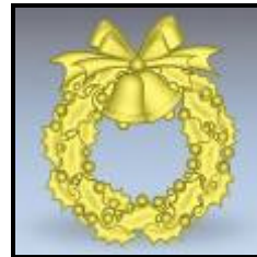
7 Holly Wreath