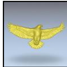
11 Bald Eagle