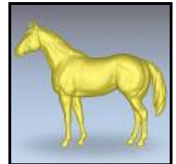
12 Quarter Horse