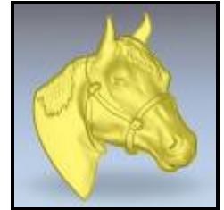
4 Horse Head