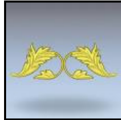
2 Leaf Pair 2