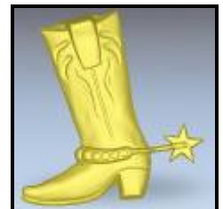
20 Cowboy Boot 1