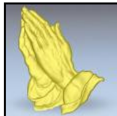
14 Praying Hands