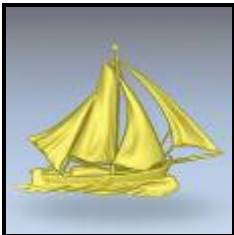
9 Fishing Boat