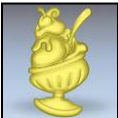
17 Ice Cream Sundae