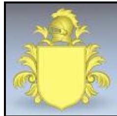
10 Coat of Arms Shield