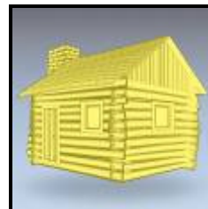
15 Log Cabin