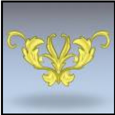
1 Flourish 1

This collection of CNC ready, dimensional clipart will add value to cabinet doors, furniture, signs, awards, jewelry and many other products. The collection is comprised of 20 designs in 3 styles: (A-Raised, B-Dished and C-Hand Carved Recess)