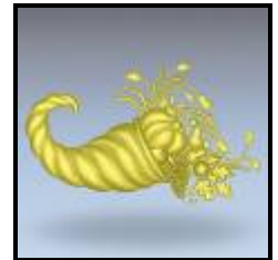
8 Cornucopia 2