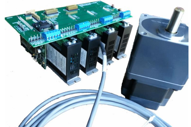
Card, Drives, and Interface Board Assembled