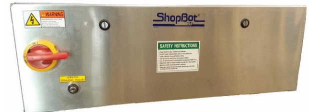
Control Box Exterior