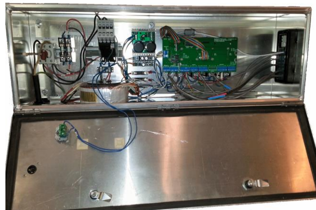
Control Box Interior