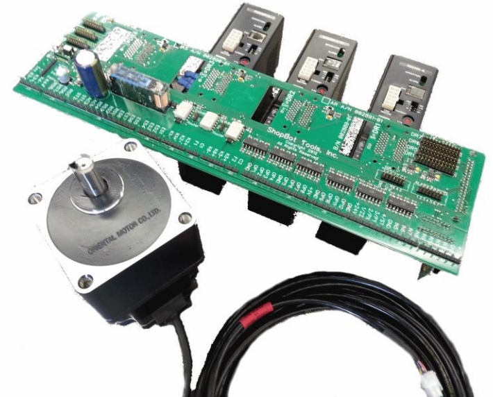
Card, Drives, and Interface Board Assembled