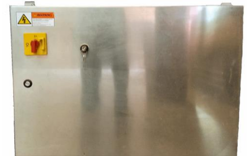
Control Box Exterior